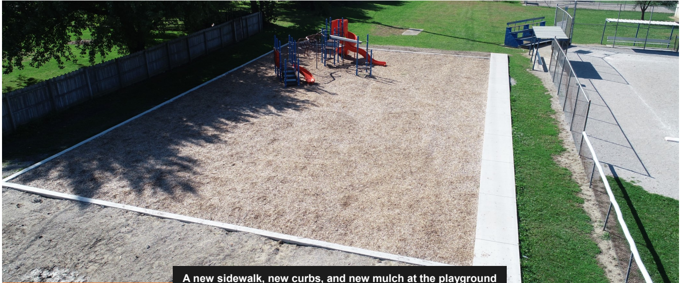
A new sidewalk, new curbs, and new mulch at the playground