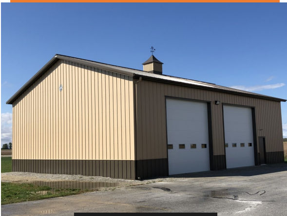
The new storage building

There are many green 911 address signs missing throughout the township, and many of the older signs have lost their reflectivity. If anyone wants a new sign or wants to update their old sign, contact Isaac Bailey.